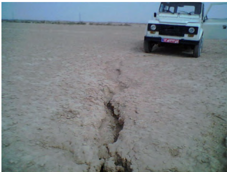
Pic. 1: The land cracks in Yazd region, Central Iran.

and XRF methods. The coefficient of expansion (COLE) of the soils was calculated according to Keys to Soil Taxonomy (2006). Cation exchangeable capacity (CEC) of the soils was determined by sodium acetate and ammonium acetate. Exchangeable sodium percentage (ESP) of soils was measured by ammonium acetate and calculated with CEC.