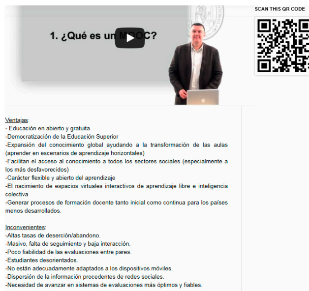
Figure 1. Edublog of a student in which she makes a metacognitive and reflexive analysis of the positive and negative aspects of the MOOC courses.

In Figure 1, an edublog made by a student of this subject is presented as an example: