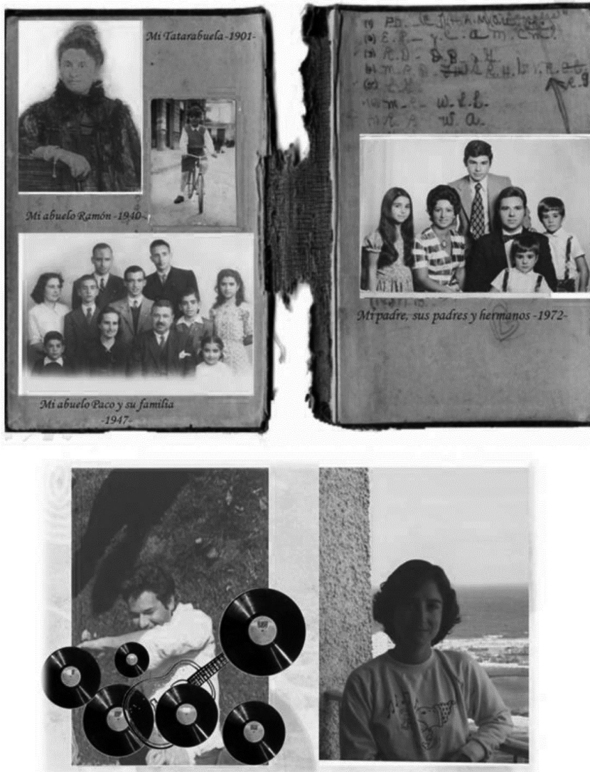
Figure 2. Selection of Images of the Micro-Tale of the Student A. C.-C.

Concerning the sounds, we suggested using recordings of their own voice or of their informers and other human sounds, natural and artificial, collected or downloaded from sound banks such as fragments of musical pieces, manipulated or not, leaving to their judgement the way of integrating them with imagery and text (as a background, the soundtrack of the tale, or alternated as a slideshow) (see Testimony 4, Figure 2 and