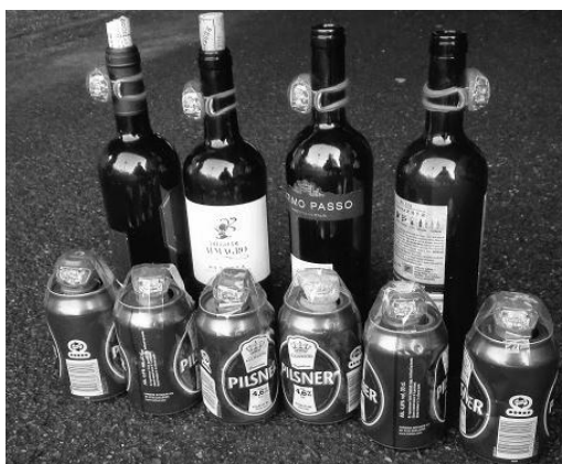
Ilustración 2. Items used as part of the confounding task

All stimuli were equipped with LED lights. Beer cans had white lights, and bottles of wine had red lights. The stimuli were placed in two stretches. The first stretch contained three bottles of wine, and one beer can placed two street lights from each other, beginning with the second street light. The third item was a beer can. All of these stimuli had lights that were constantly on.