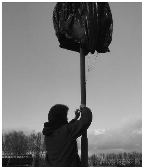
Ilustración 1. Researcher covering the streetlights for the experimental condition

All stimuli were equipped with LED lights. Beer cans had white lights, and bottles of wine had red lights. The stimuli were placed in two stretches. The first stretch contained three bottles of wine, and one beer can placed two street lights from each other, beginning with the second street light. The third item was a beer can. All of these stimuli had lights that were constantly on.