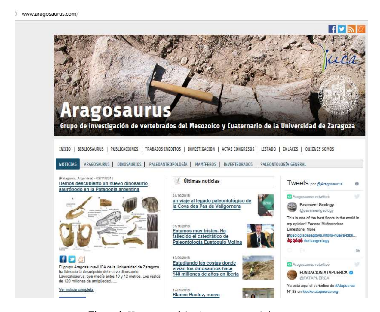
Figure 2. Homepage of the Aragosaurus website.

Finally, RGWs also feature information mainly intended for the group, to facilitate their activity. One of the respondents stated that on their "links page" they included any link that could be of interest to the group: disciplinary links, links to websites useful for any researcher (e.g. SciFinder, Scopus) or links to the websites of national and international agencies. Three of the websites also provide password-protected access to the group's Intranet or the group's Dropbox files. In these online spaces the members of the groups share questions, internal procedures, and any document that is only intended for internal use. These spaces help therefore to increase group cohesion, facilitate the exchange of information within the group and stimulate group dynamics.