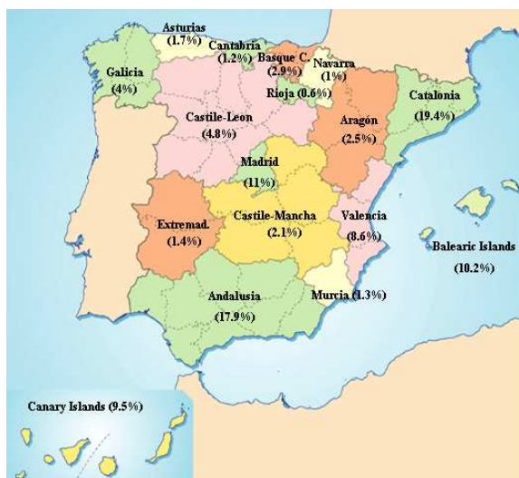
Figure 5: Percentage of visitors in 2013 staying one or more nights in a hotel in Spain by Autonomous Communities.

Two models, one for domestic tourism and another for international tourism, are estimated using data disaggregated by region of destination. We use a balanced panel data set consisting of the 17 Autonomous Communities of Spain for the period 2000-2013. The panel data has some advantages over cross sectional or time series data. One is that it enables us to control for unobservable cross sectional heterogeneity, which is common in regional data. Time series and cross section studies not controlling for this heterogeneity run the risk of obtaining biased results. Moreover, panel data usually give a large number of data points, increasing the degrees of freedom, reducing the collinearity among explanatory variables and improving the efficiency of econometric estimates (Hsiao, 2003 and Baltagi, 2008).