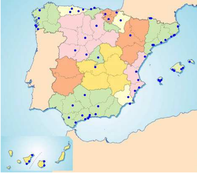
Figure 1: Tourism spots in Spain in 2001

mainly situated on the coasts of the Mediterranean and Atlantic and its two archipelagoes. In 2013, all regions have some tourism spot.