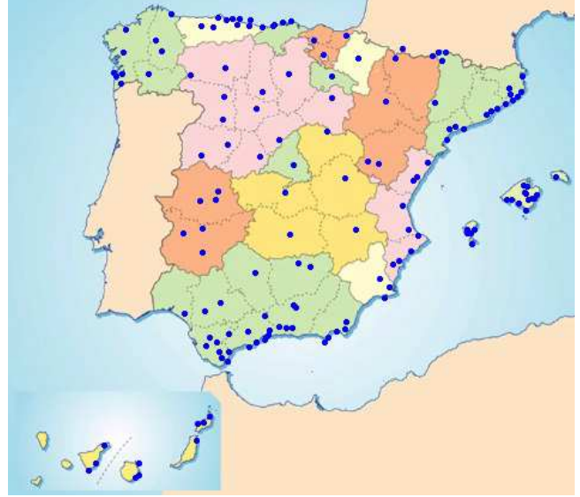
Figure 2: Tourism spots in Spain in 2013

The number of tourism spots is a quantitative measure of the tourism supply of a destination but also of the space distribution of the services offered. In Spain, the National Statistics Institute of Spain (INE) identifies as "tourism spot" a municipality where the concentration of tourism supply -not only lodgings- is significant. All these spots count on some important tourism attraction (beaches, monuments, etc.) or are near to an attraction; the greater the number of tourism spots, the larger the spatial dispersion of supply and therefore the higher the chance to accommodate visitors, that is, lower congestion. The number of tourism spots in Spain can therefore be used as a proxy of its carrying capacity, assuming the limitation of each tourism spot can serve equal numbers of tourists. The advantage of using this measure is that its homogeneous character allows comparison among several destinations.