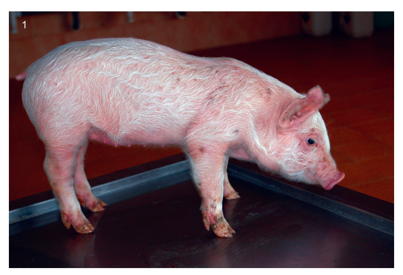
Figure 1. Affected 5-weeks-old piglet with appearance of lordosis.