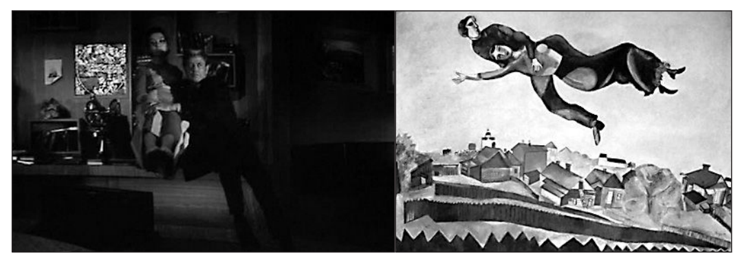
Picture 7. Episode of weightlessness and Chagall's Au Dessus de la Ville.

Giving more examples turns a haphazard fact of visualisation to a systematic technique. In the episode of weightlessness from Solaris, devoted to Bach's Prelude<sup>13</sup>, there comes an on-screen visualization of Marc Chagall's soaring lovers, including some typical details of candle light.