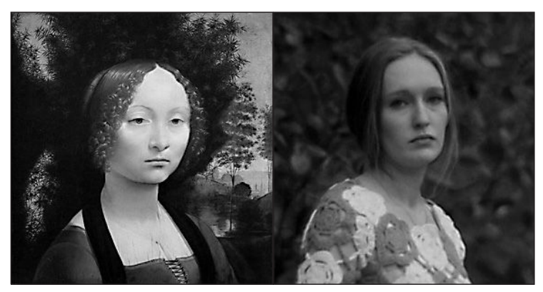
Picture 6. Resemblance between Ginevra Benci and Mother from Solaris.

The mother's gaze goes beyond the world, and her face does not tell her personality. Neutral countenance, aristocratic estranged blank look with tiredness and melancholy in it, lack of smile, eye expression without a touch of warmth: all those conflicts with the mother's archetype. She appears a cold, contemplative lady, a being of a dual nature, enigma of the film, remained nameless. Her image, her pose, manners, hair-style, clothing, and a little animal make her a double of the Lady . Besides, in this representation the mother's image is close to Ginevra Benci.