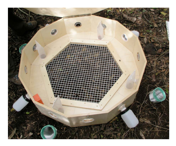
Figura 2: Fotografía del interior de la trampa.