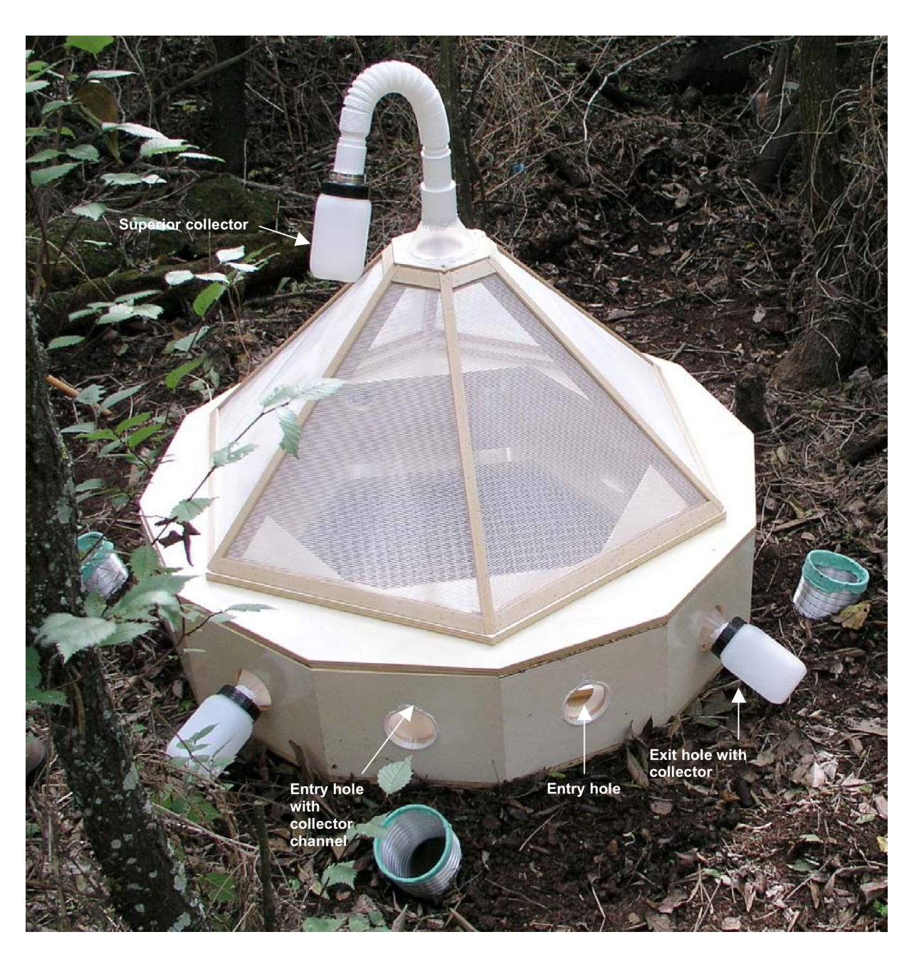
Figura 1: Fotografía del exterior de la trampa.

emerging inside the trap are also collected, as well as migratory larvae that leave the carcass. With this method, all insects that are attracted to the carcass and enter the trap are captured, thus giving a total census, not only samples. Physical contact with the bait during sampling is not needed, arthropods are collected continuously and automatically, reducing the disturbance in the colonization and collector's bias is not introduced. Even thought, only a few works refer Schoenly traps as methodology for collecting arthropods