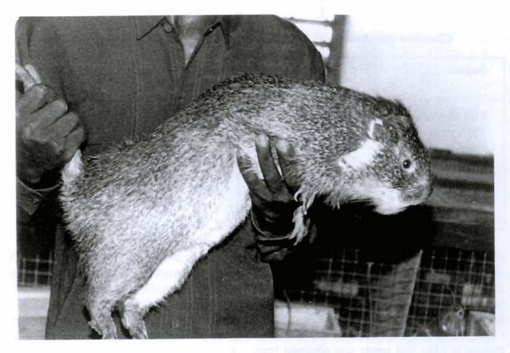
FIGURE 1. The grass-cutter, Thryonomys swinderianus (TEMMINCK 1827), in captivity.

present basic data on plasma lipids and lipoproteins in the grass-cutter, Thryonomys swinderianus .