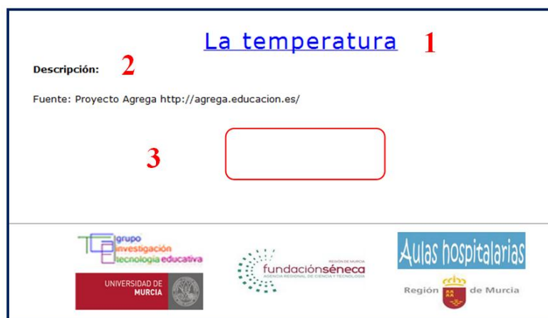
Figure 3 (screenshot of the search results)