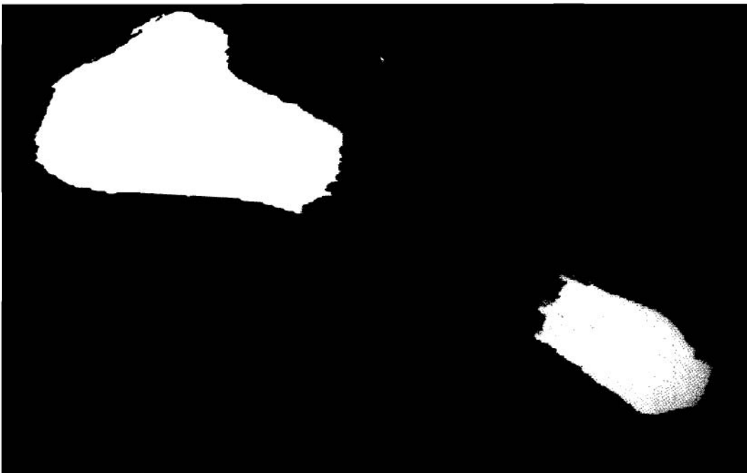
Fig. 8. Murine tibia cultured in vitro, Mellitic acid (5mmol) incubated, digitized section, scan mode 1 (280*192 pixels) after subtraction of diaphysis, containing only the part of the epiphyseal cartilages.