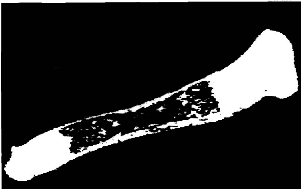
Fig. 5. Murine tibia cultured in vitro, control group, digitized section, scan mode 1 (280*192 pixels).