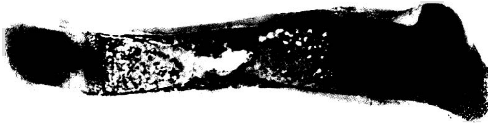
Fig. 4. Murine tibia cultured in vitro, 4 \mu section, Sodium Fluoride (0.5mmol) incubated. von Kossa's silver impregnation with Toluidine blue counterstaining.