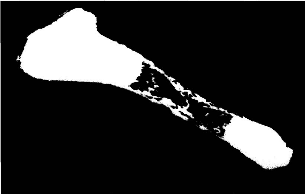
Fig. 7. Murine tibia cultured in vitro, Mellitic acid (5mmol) incubated, digitized section, scan mode 1 (280*192 pixels).