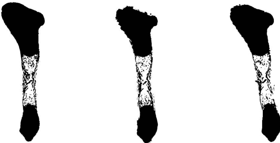
Fig. 3. Murine tibia cultured in vitro, 4 \mu serial sections, Mellitic acid (5mmol) incubated, von KOSSA's silver impregnation with Toluidine-blue counterstaining.