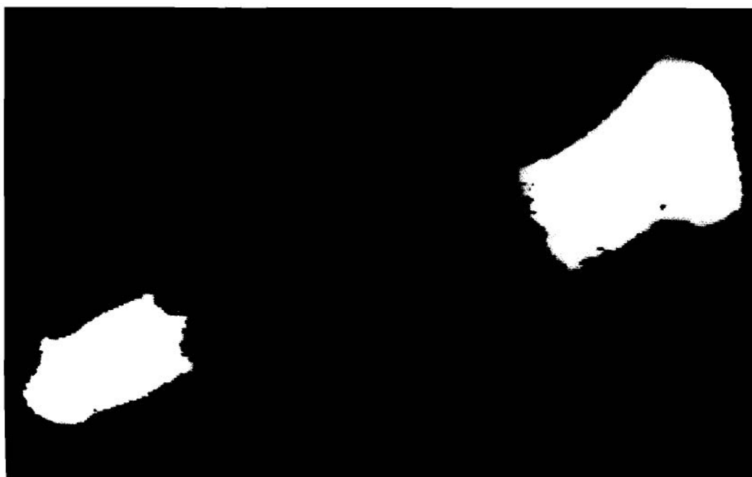
Fig. 6. Murine tibia cultured in vitro, control group, digitized section, scan mode 1 (280*192 pixels) after subtraction of diaphysis, containing only the part of the epiphyseal cartilages.