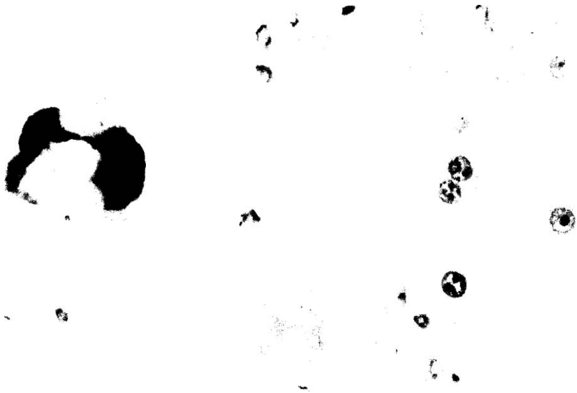
Fig. 2. Section stained for HBsAg, HBcAg, Delta-Ag, respectively appearing as dark black in the cytoplasm, blue and red in the nuclei. PAP (triple staining). x 660