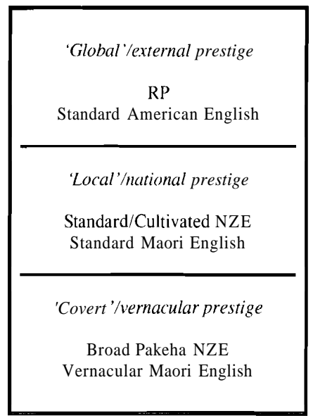
Figure 1 : Possible types of prestige relating to New Zealand accenis

Since we have little research in this area at present. it is only possible to speculate. It seems likely, however, that vernacular varieties of ME have vernacular prestige, at least among Maori, and perhaps especially for Maori males, and possibly for some Pakeha people too (Robertson 1994). It is possible that a 'broad' New Zealand accent also has vernacular prestige among some groups, and perhaps in rural areas. It is clear that more research is needed on attitudes to New Zealand accents to help tease out some of these issues (see Figure 1).