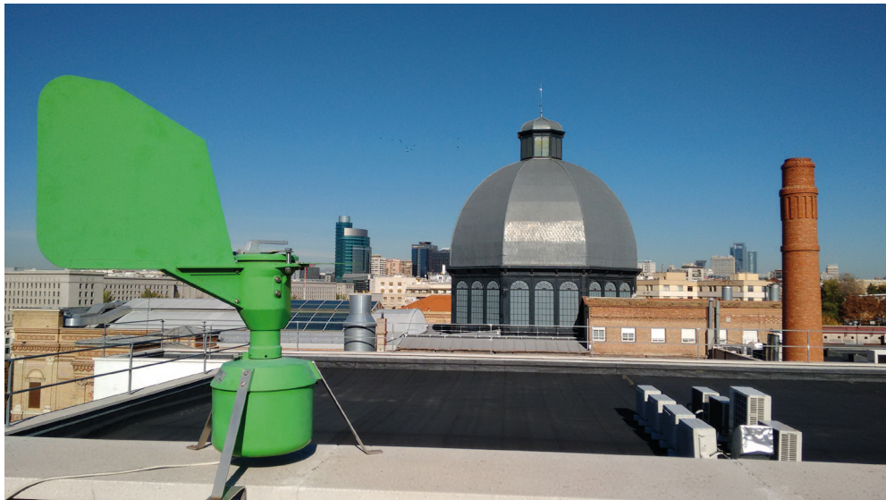
Fig. 1. Air collector placed on the roof of the Higher Technical School of Industrial Engineering, Madrid. The octagonal dome, 42 m high, was built in 1881–1887, originally to host the Palace of Arts and Industry of Madrid. The School was located in the building in 1907. (See cover and page A2 of this issue.)

logical particles to be non-significant as a source of IN at global scale [51]. Even so, biological particles may be important at altitudes between 4 and 7 km, where the contribution of IN of biological origin becomes dominant at temperatures warmer than -15^{\circ}\text{C} whereas mineral dust particles are typically considered to be the major contributor below this temperature [24,66].