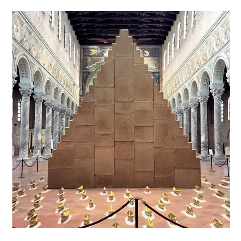
Figure 5. Installation view of Wolfgang Laib's works at Sant'Apollinare in Classe, Ravenna.

The installation invades the nave and yet somehow seems to have been created together with the place. The scent of the beeswax conquers the church. The rice carried by the ships is nourishment not for the body but the soul. The temporary installation includes a group of tiny pollen mound placed on the steps of the church's altar for only three days, until the celebration of the Sunday Mass, which reinforced the imbricated nexus between the work and the Basilica.