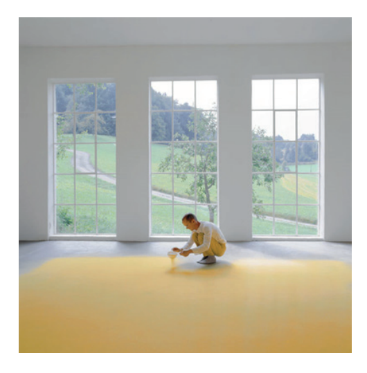
Figure 2. Wolfgang Laib installing a pollen piece in studio in Germany, circa 1987. © Wolfgang Laib

This process of discovering how to illustrate the work in the most convenient manner took place in his studio. The artist recognizes that any professional photographer would shoot the works leaving the windows behind so that the shapes and materials appear clear and hard in definition, but he seeks the opposite. "It actually all started with photographs in my studio", Laib states, "(...) I photographed my work there against the light shining in through the windows — on the gray studio floor, in as deep a position as possible. And that creates a quite unique loss of materials qualities, it almost conjures up an aura" (Sönmez, 2009, p. 33). Regarding this, in another interview with gallerist André Buchmann, Laib praises the privacy and quietness of his atelier in the following terms: