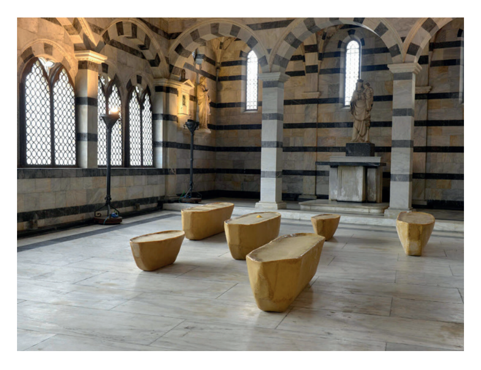
Figure 6. Installation view of Wolfgang Laib, Somewhere Else, Chiesa della Spina, Pisa.

More recently, in 2020, Laib presented one of his most extensive and ambitious projects: a multisite exhibition that occupied some of the most prestigious cultural institutions in Florence – Museo di San Marco (Polo Museale della Toscana), Cappella dei Magi (Palazzo Medici Riccardi), Cappella Rucellai (church of San Pancrazio, Museo Marino Marini) and Cappella Pazzi (Monumental Complex of Santa Croce). In the aforementioned sacral spaces in the city, five works were installed in direct response to the sites' serene and holy character. 600 years of history separated the works and the buildings. In this context of early Renaissance frescoes and architecture, Laib brought delicate, small pieces that converses with the art of great past masters: Filippo Brunelleschi, Leon Battista Alberti, Benozzo Gozzoli and Beato Angelico.