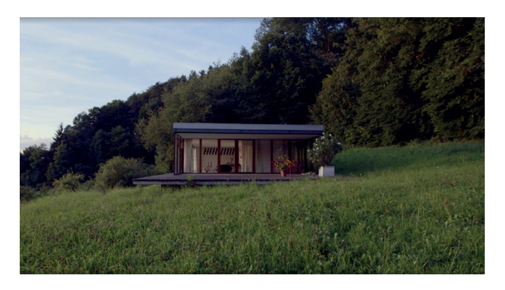
Figure 1. Wolfgang Laib's family glasshouse in Biberach, Southern Germany.