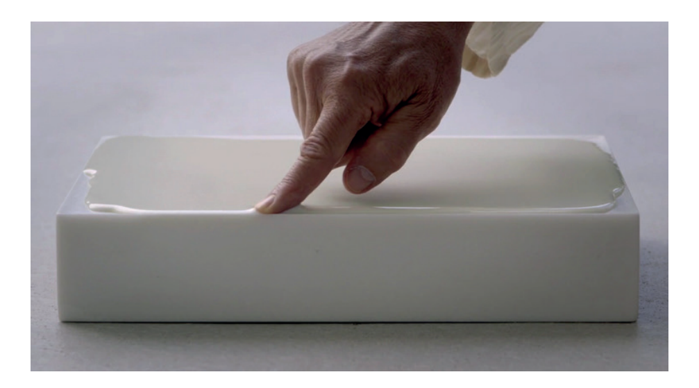
Figure 4. Wolfgang Laib, Milkstone, date unknown. Milk and marble. 68 x 68 x 120 cm.

It's a small slab of pure white marble which has a very, very fine indention on the top with a rim. I work first with a small machine, but most of the rim and everything I grind by hand with sandpaper and water, which is a lot of work. But it's a very beautiful, meditative work, which I always like to do. I participate in something which I feel is very independent of myself and also has a universal meaning. And you pour milk into this on the surface, which is only for some hours, and then it has to be replaced. I mean the stone is like millions of years old and the milk is just there for some hours. It's a very very simple thing, but the milk surface can contain everything you can think of. (MoMA, n.d.)