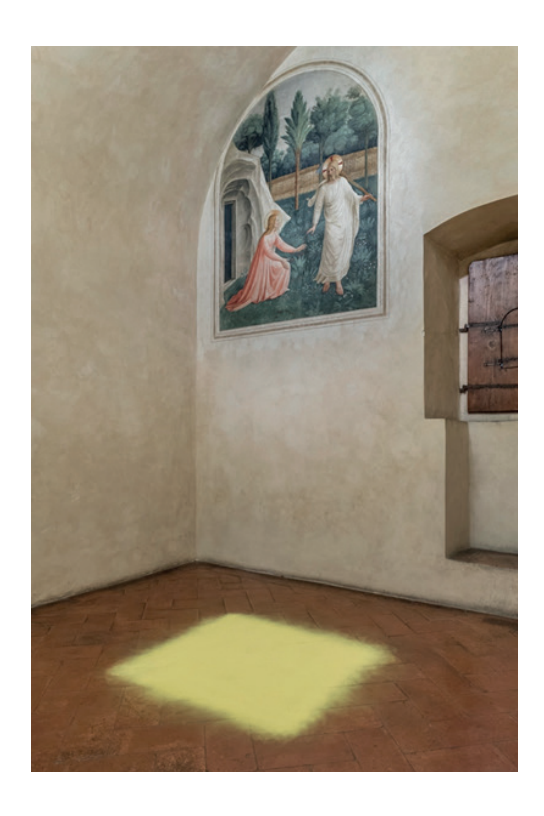
Figure 7. Wolfgang Laib's pollen installation at Museo San Marco, as part of the exhibition Without Place, Without Time, Without body in Florence.

In the Dominican friary of San Marco, and for the first time in the history of the institution, a contemporary artist installed a piece in the cells of the convent, the heart of the San Marco Museum, entering in dialogue with mural paintings by Beato Angelico, which were created between 1436 and 1446. Laib presented two pollen pieces, one of them next to Fra Angelico's fresco, which depicts a lushing garden (fig. 7). The material, either in the form of a tiny heap or sieved on the ground, resonates with this abundance of life, and "contains the potential to connect associatively with gardens of entirely different cultures and eras, from the ancient cultures of all continents to the present" (Thierolf, 2022, p. 47).