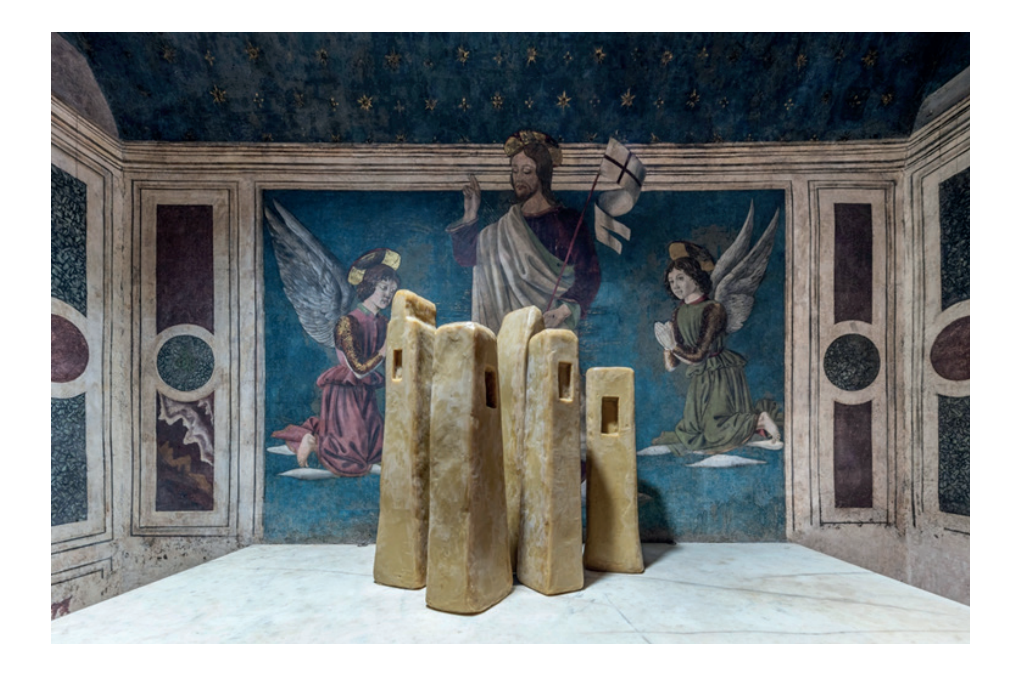
Figure 8. Wolfgang Laib's wax towers presented in the Rucellai Chapel, as part of the exhibition Without Place, Without Time , Without body in Florence.

Inside the Rucellai Chapel, the Holy Sepulcher, a jewel of Leon Battista Alberti's architecture, Wolfgang Laib presented a new group of works made of beeswax (fig. 8). Positioned directly on the marble altar, the small fortification-like figures are inspired both by the architecture of medieval Italy and the Towers of Silence used in Zoroastrian excarnation rites in ancient Persia. Synthetic and essential, their height seem to refer to an ideal ascension upwards. The Renaissance sarcophagus, conceived to repair and isolate the body beyond life, dialogues with Laib's beeswax buildings, for the material has been known all over the world for its soothing and protective properties since primeval times. In fact, ancient papyrus record that Egyptians believed bees had been created by the tears of the sun god Re.