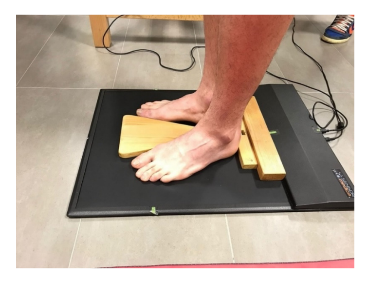
Figure 1. Wooden spacer for position standarization.

The participants had to stand barefoot on the baropodometric platform and with their feet at a 15-degree angle from the sagittal plane and heels separated by 2 cm. To ensure the initial standardization of this position, we have designed and used a wooden spacer, which was removed once the position was achieved (Figure 1). Measurements were made first in the open eyes condition (OE) and then closed eyes (OC) for 90 s to evaluate postural control with and without visual input. The measurement conditions were reproduced exactly for each group (soccer players and control group).