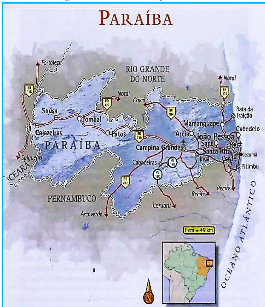
Figure 2. Baía da Traição – Brazil

The study uses a quantitative approach as descriptive research for evaluating the quality of services in a cultural tourism destination. The categories and indicators used to describe the perception of quality by tourists from a cultural destination were selected from the TOURQUAL Model. Flick (2009) instructed a circular research process, which allowed for the reassessment and review of data treatment and analysis.