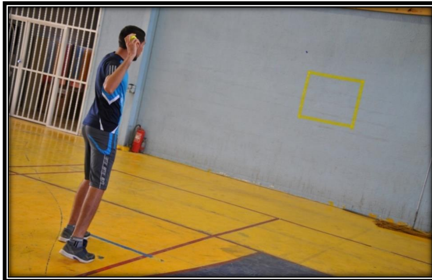
Figure 2. The test of throwing and receiving the ball against the wall to measure eye-hand coordination