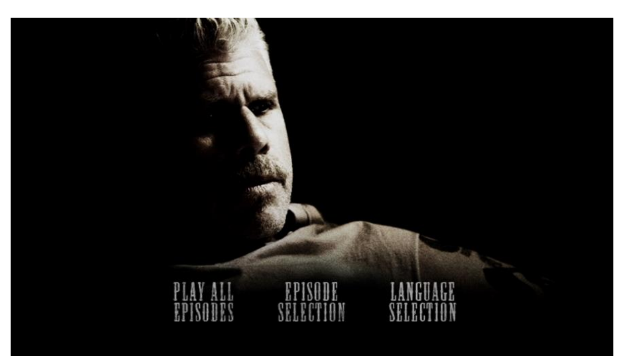
Figure 1 Extracted from Menu in DVD 1, Series One. Standard Edition, DVD Box Set.