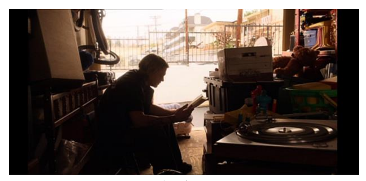
Figure 2 Extracted from Sutter (2008).

Mittel's term, for "something that is already there, buried beneath the surface" (2015: 289) in SOA 's deep agglutination of sections from Hamlet and residues from other Shakespearean tragedies.