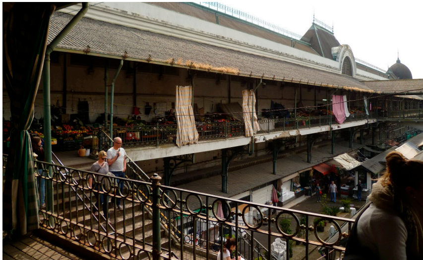
Figure 2. Bolhao Market Porto, Portugal.