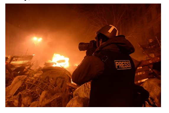
Figure 8. Image for Speaking Part 2 (Source: Pixabay - Journalist documenting events at the Independence square. Clashes in Ukraine, Kyiv)