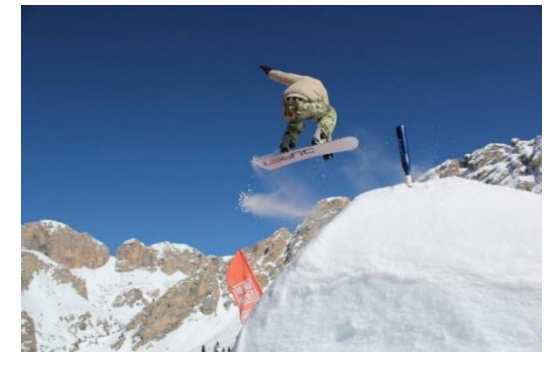
Figure 6. Image for Speaking Part 2