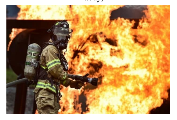
Figure 7. Image for Speaking Part 2