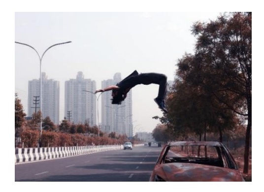
Figure 5. Image for speaking 2

Upon the adaptation of the written test, supervision and approval were requested from ONCE. The tutor of the organisation was in charge of evaluating how accessible the examination paper was to the partially sighted student. After a couple of weeks, we obtained the green light for the accessibility of the format and layout.