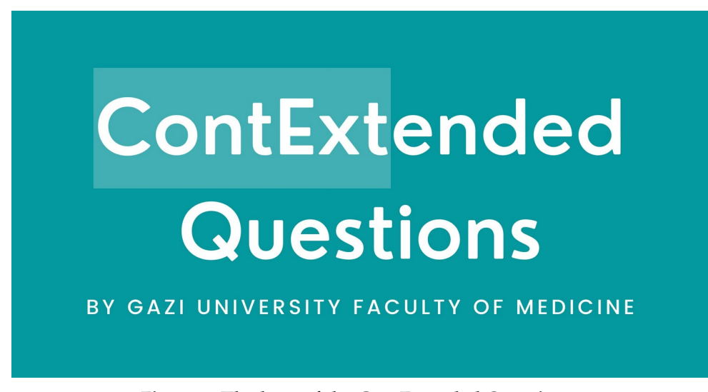
Figure 4. The logo of the ContExtended Questions.